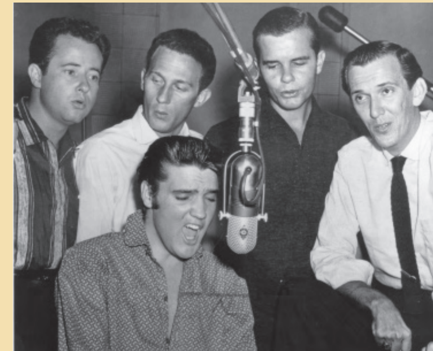
Elvis Presley and the Jordanaires at Studio B

Celebrating over 50 years of music history, Historic RCA Studio B provides a glimpse into the heart of Nashville music-making during one of its most exciting and classic periods.