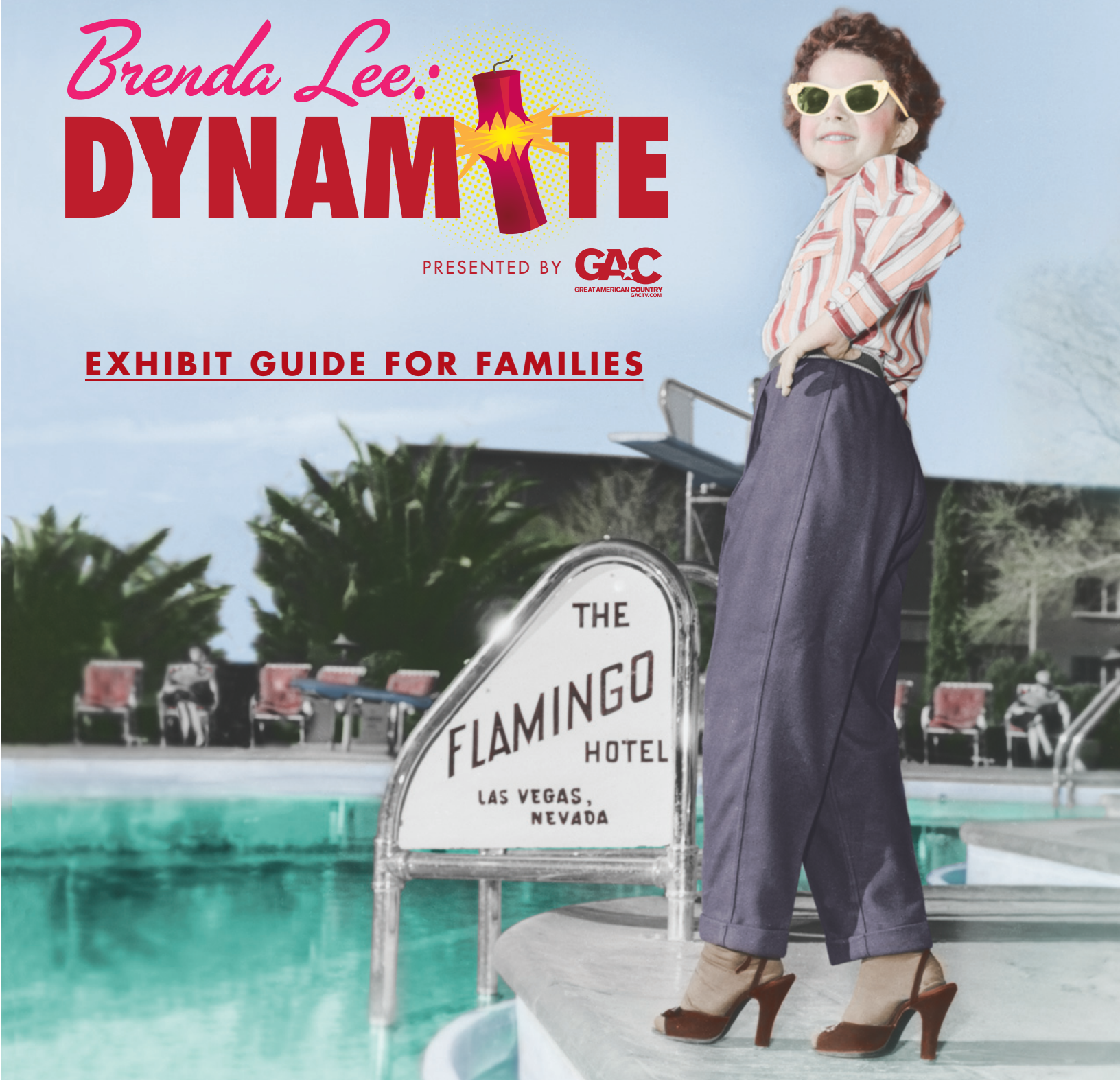
EXHIBIT OPEN AUGUST 2009–JUNE 2010

Brenda Lee is one of the most beloved entertainers in the world. She made her television debut at age six. Throughout her career, she has sung many styles of music, including country, rock & roll, and gospel. Some of her biggest hits, including